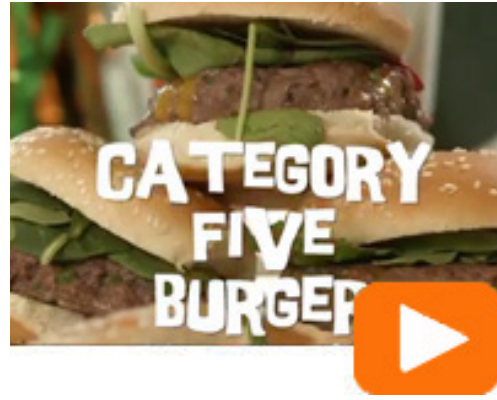
yUmmies: Category Five Burger