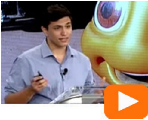
Choosing Not to Choose