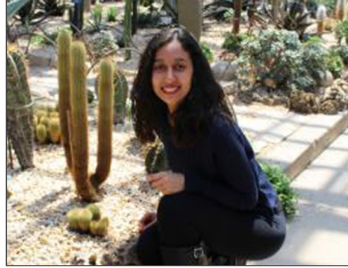
Association for Study of Cuban Economy Awards UM Students 1st Place