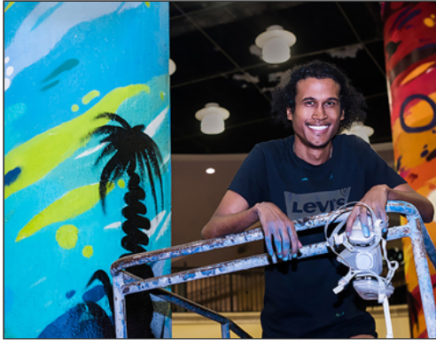
Stunning Art at Shops at Sunset Place