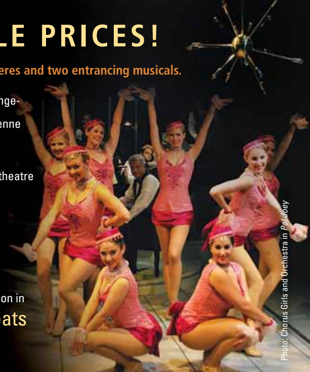
Photo: Chorus Girls and Orchestra in Pal Joey

Only season ticket subscribers —who had the foresight to buy the entire season in advance at discounted prices before shows sell out—never stand in line, get the best seats and never miss a performance!